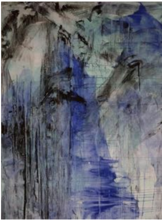
"Still Point" Makoto Fujimura

And so we call back, "Send out your light and your truth; let them lead me; let them bring me to your holy hill and to your dwelling. Then I will go to the altar of God, to God my exceeding joy, (Psalm 43.3-4a).