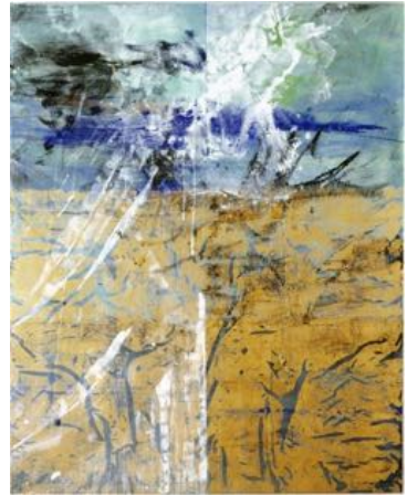
"Luke - Prodigal God" Makoto Fujimura