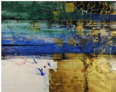
"Tree Grace" Makoto Fujimura