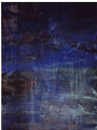
“Between Two Waves and the Sea” Makoto Fujimura

In dreams the will to fight back is always present. The foe arises—this-worldly or other-worldly, a recognizable form from conscious life or the fleshly incarnation of some subconscious fear. But our hands, our feet do not respond. Some invisible force renders them lifeless to punch, to kick. Powerless.