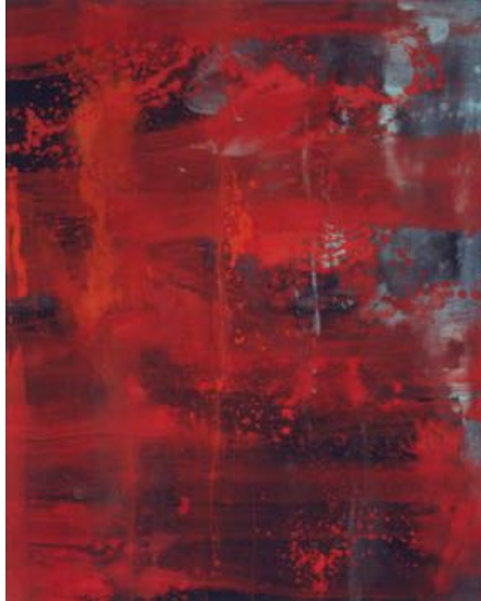
"Passion" Makoto Fujimura

18 You have caused my beloved and my friend to shun me; my companions have become darkness.