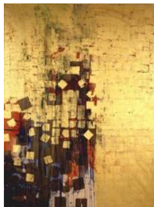
"Zero Summer" Makoto Fujimura

- John Donne, from "Good Friday, Riding Westward 1613"