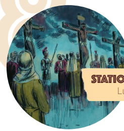
STATION 8: THE THIEVES Luke 23:39-43

Take a wooden cross to remember Simon of Cyrene carrying the cross.