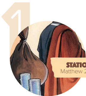
STATION 1: JUDAS Matthew 26:14-16; 47-49

Judas, one of Jesus' disciples, went to the chief priests and they promised to give him money, so he watched for a chance to betray Jesus. Judas came to Jesus in the garden and kissed him, which was a sign for the soldiers to arrest Jesus.