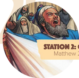
STATION 2: CAIAPHAS Matthew 26:57-65

Take a coin to remember Judas betraying Jesus.