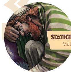
STATION 3: SIMON PETER Matthew 26:69-75

Take a piece of torn fabric to remember Caiaphas tearing his clothes in anger.