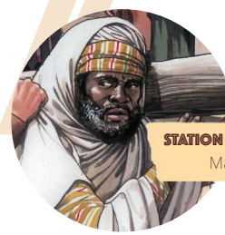
STATION 7: SIMON OF CYRENE Matthew 27:32

Take a nail to remember the Roman soldiers nailing Jesus to the cross.