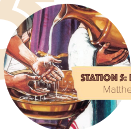
STATION 5: PONTIUS PILATE Matthew 27:11-26

Take a piece of purple cloth to remember Herod dressing Jesus in a fine robe and mocking him.