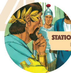
STATION 4: KING HEROD Luke 23:8-12

Take a feather to remember Peter disowning Jesus three times before the cock crowed.