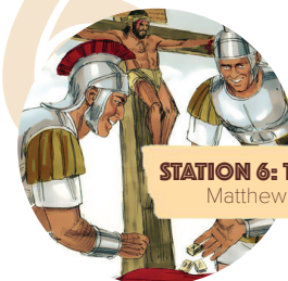
STATION 6: THE SOLDIERS Matthew 27:2 7-31

Take a shimmery blue stone to remember Pilate washing his hands in water when he handed Jesus over to die.